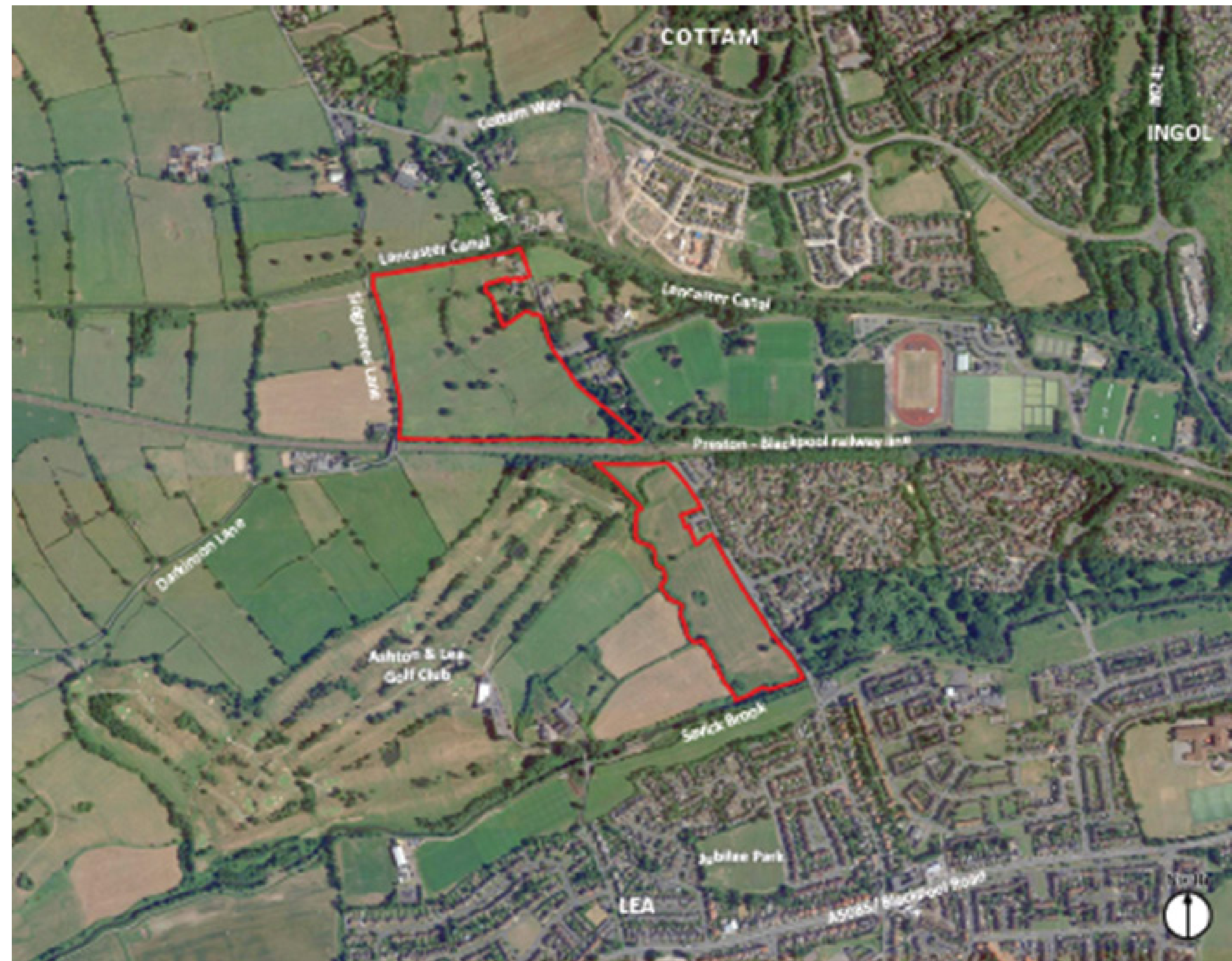
Image: site location plan

As part of preparing this proposal we would like to seek your feedback.